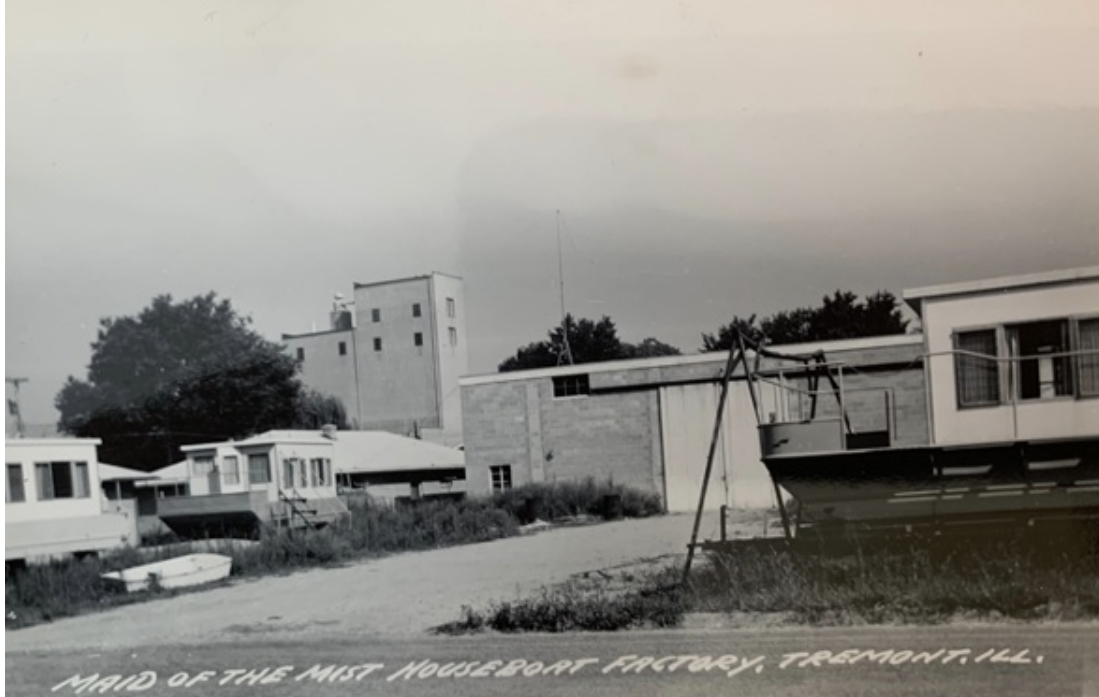
Pictured: Maid of the Mist Houseboat Factory